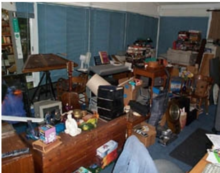
The Painter's Mess!

Monday mornings, stay over on our boat there during the week, and then